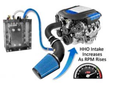
HHO – Gas Circuit

the combustion chamber and is burnt. Once burnt, it converts back to H_20 and then absorbs the inner heat from the engine (at around 175 to 205°C) whereupon it turns into super-heated steam which is then pushed out during the exhaust stroke via the exhaust system. It then condenses back into to water vapour and eventually collects back into water. The process gives a really odorless exhaust with very low HC, CO and NO<sup>2</sup> emissions and only water vapor from the exhaust pipe. Why vapor instead of water - because the hydrocarbon fuel [petrol] produces enough heat during combustion to keep the burnt HHO in a water vapor state, leaving it to totally condense back into water outside of the exhaust system thereby eliminating internal corrosion !